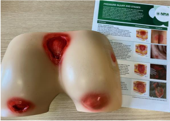
Pressure injury and treatment